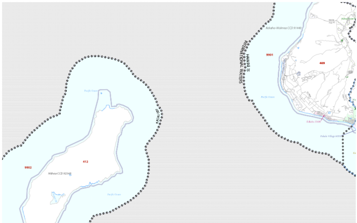
Figure 2. 74

and surrounded by tract 9901). Recognizing that each of these particular census tracts would independently qualify as a rural area based on the 5-year American Community Survey (ACS) data from 2021, Figure 2 is being used for illustrative purposes for when a census tract separated by a body of water that has its own census tract number would not be directly adjacent to another tract.